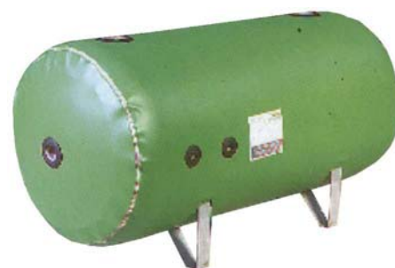
SKY INSULATION KIT